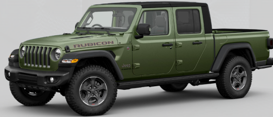
PGG - Sarge Green (Option)