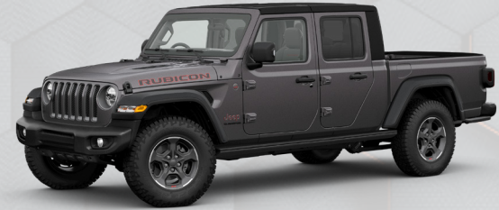
PAU - Granite Crystal (Option)