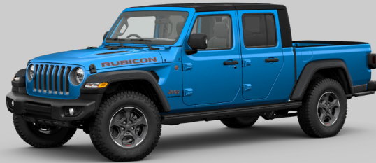
PBJ - Hydro Blue (Option)