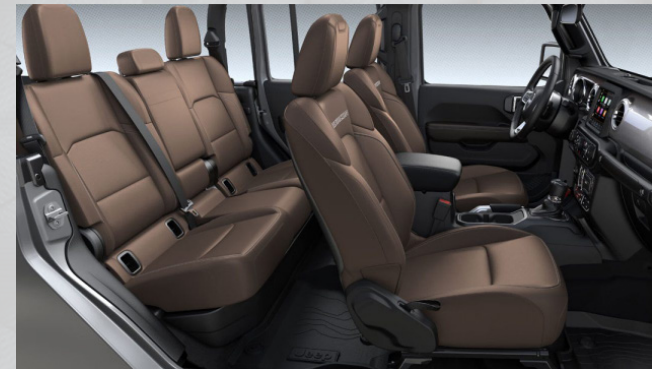
ALTV - Dark Saddle Leather Trimmed Bucket Seats (Option - Rubicon)