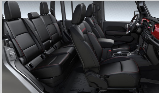
ALX9 - Black Leather Trimmed Bucket Seats (Option - Rubicon)