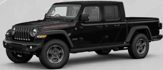
PX8 - Black (Standard)