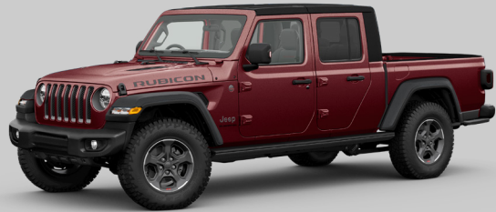
PRV - Snazzberry (Option)