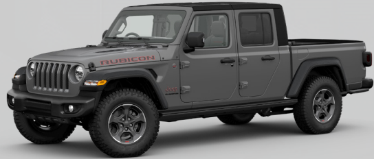
PDN - Sting Grey (Option)