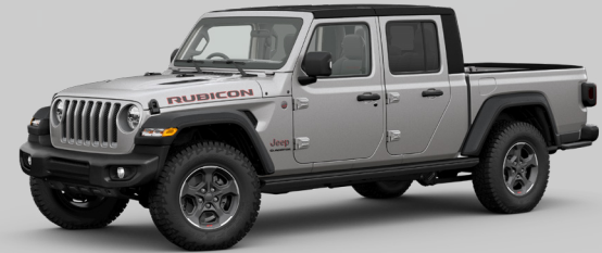
PSE - Silver Zynith (Option)