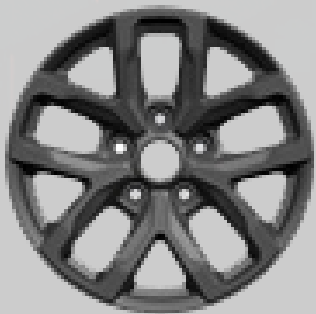
WFP - 17-inch Black Alloy Wheels (Standard on Night Eagle)

Option (O) Standard (S) Not Available (-) Not Available With (NAW)