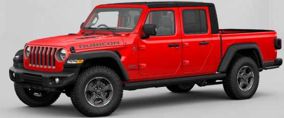
PRC - Firecracker Red (Option)