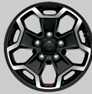
WFN - 17-Inch Polished Black Alloy Wheels (Option on Rubicon)