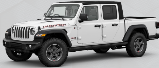
PW7 - Bright White (Standard)