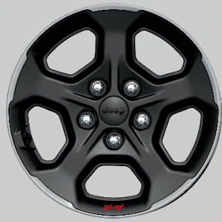
WFJ - 17-Inch Granite Crystal Alloy Wheels (Standard on Rubicon)