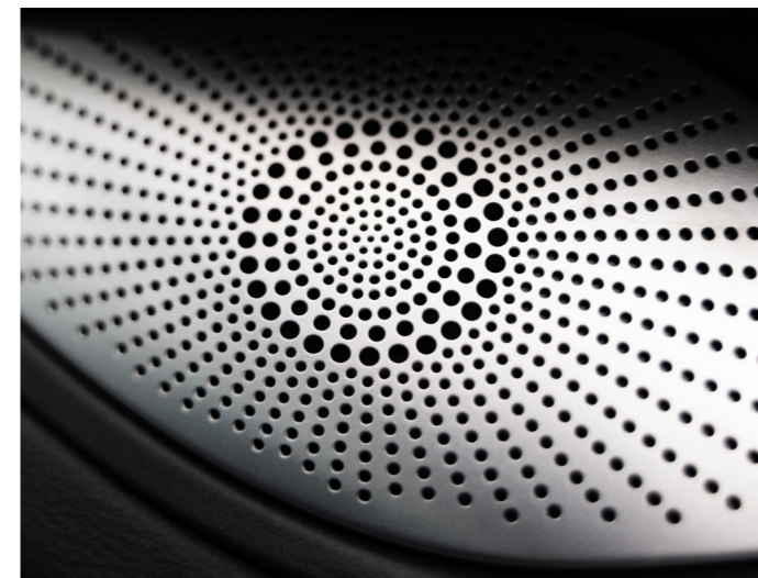
Premium DTS sound system*

The H6 is a technologically advanced SUV designed for those who want more in life. Features such as auto parking assist, a 12.3" multimedia touchscreen and a heated faux leather steering wheel give this SUV its distinct edge.*