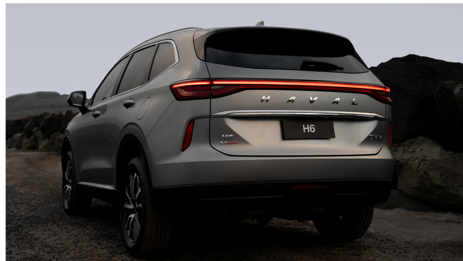
LED full width tail light