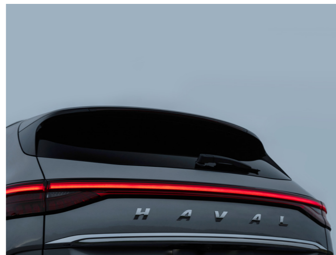
Electric Tail Gate with Memory Function*

The H6 is a technologically advanced SUV designed for those who want more in life. Features such as auto parking assist, a 12.3" multimedia touchscreen and a heated faux leather steering wheel give this SUV its distinct edge.*