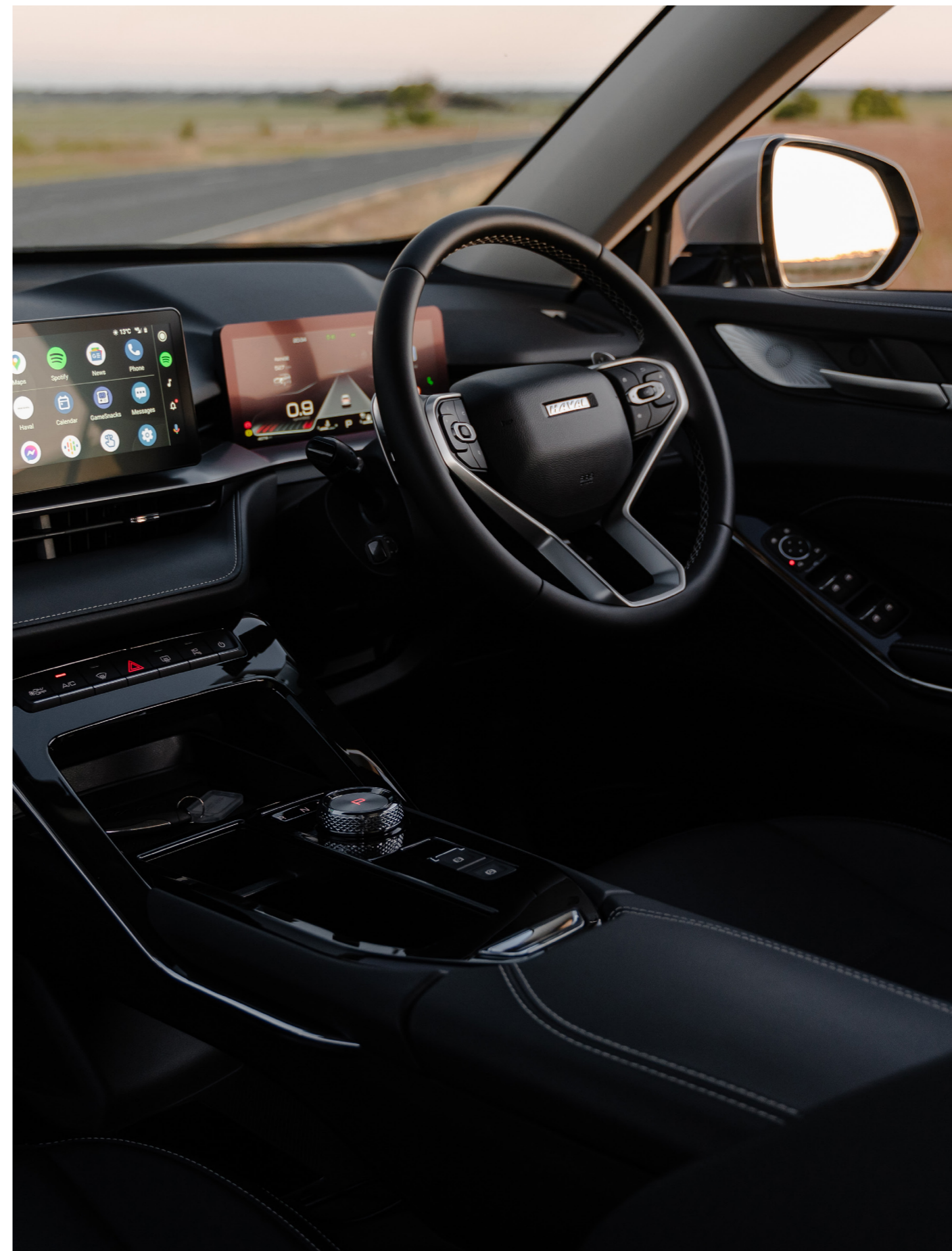
Sophisticated cabin design