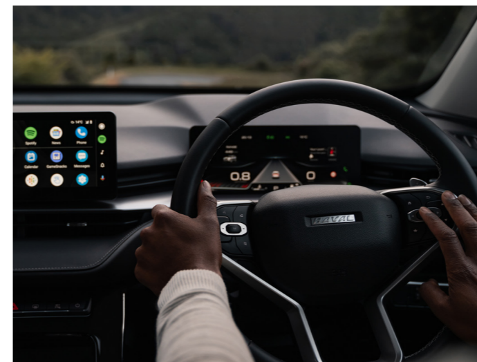
10.25" Full colour instrument cluster with heads up display*