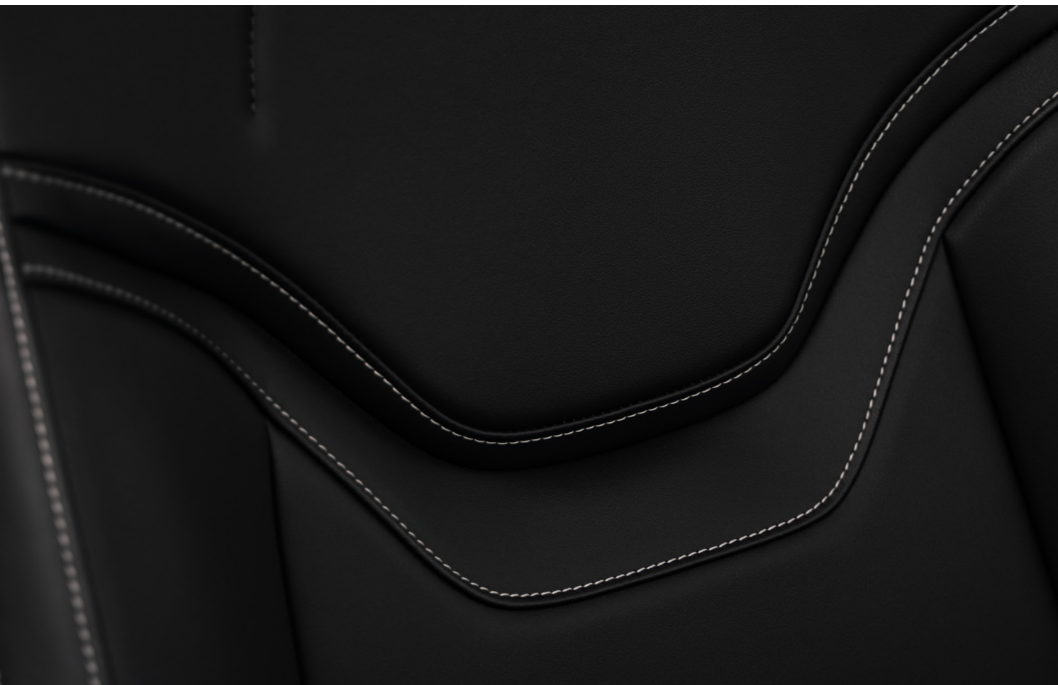
Comfort-Tek faux leather accented seats^