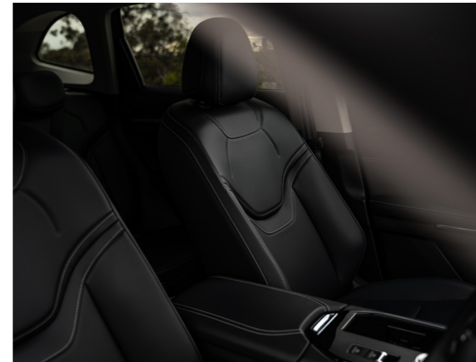
8-way electric adjustable driver seat*