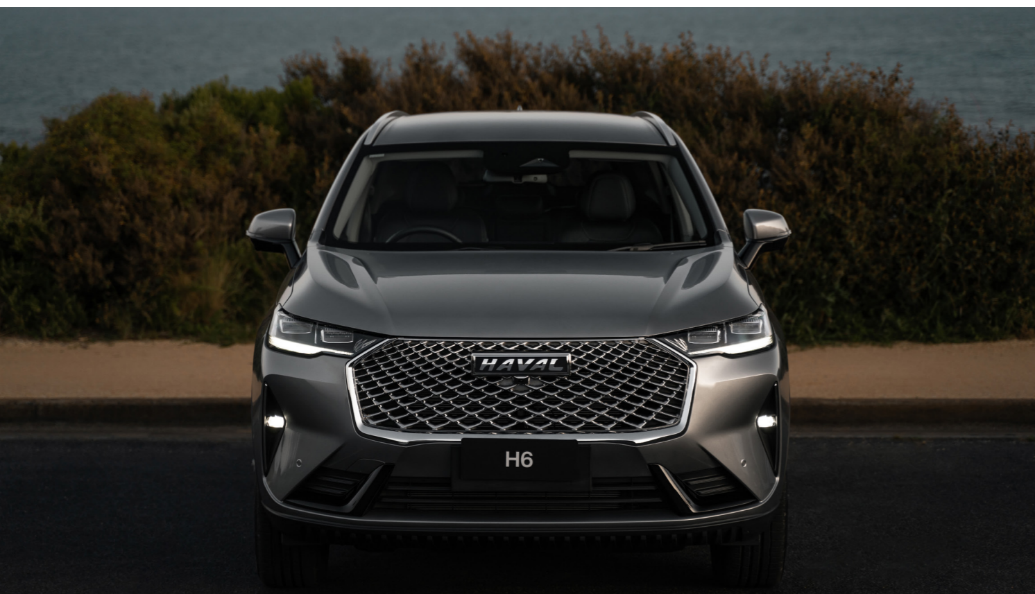
Signature front grille

From the impressive front to the stylish back, every inch of the H6 has been meticulously considered. Whether you're ducking out to the shops, or roaming far on a road-trip, your most versatile accessory will always be with you.